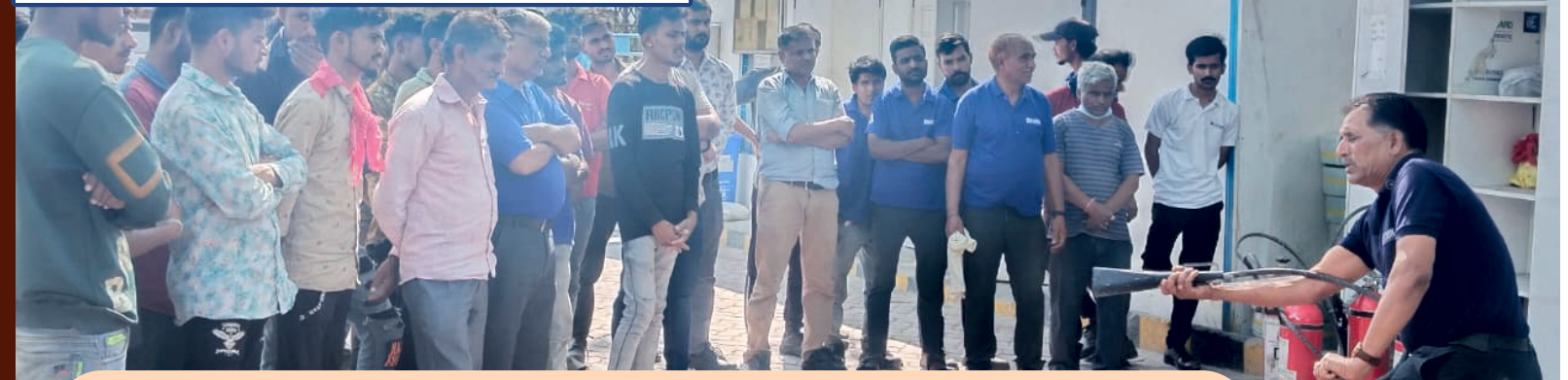
A Drill on fire fighting extinguishers to employees in the plant.